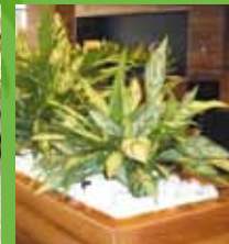
Foliage for clean air p3