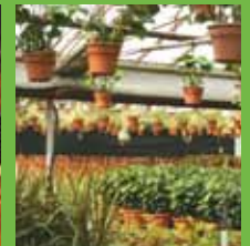
Useful tips p4